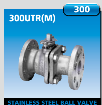
Reduced bore, Floating ball, Flanged ends Body Material: CF8/CF8M(UTRM) Size: 2~10