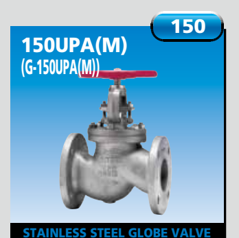
BB, Rising stem, OS&Y, Flanged ends Body Material: CF8/CF8M(UPAM) Size: 1/2~12