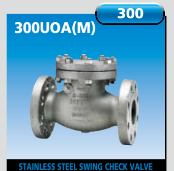
Bolted cover, Flanged ends Body Material: CF8/CF8M(UOAM) Size: 11/2~24