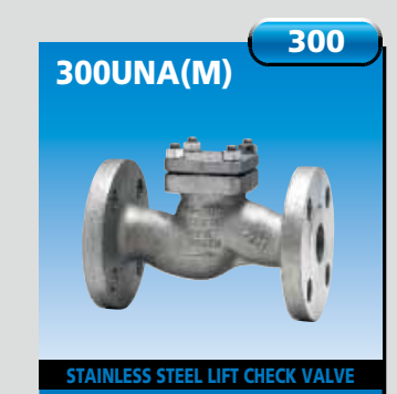
Bolted cover, Flanged ends Body Material: CF8/CF8M(UNAM) Size: 1/2~11/2