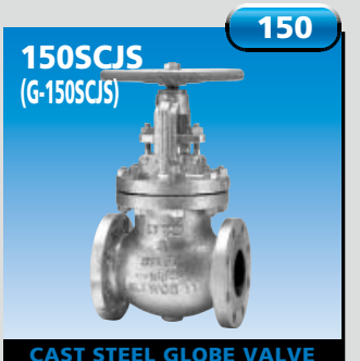
BB, Rising stem, OS&Y, Flanged ends Body Material: WCB Size: 1<sup>1</sup>/<sub>2</sub>~18