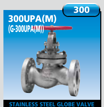
BB, Rising stem, OS&Y, Flanged ends Body Material: CF8/CF8M(UPAM) Size: 1/2~10