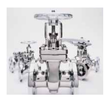
Duplex Stainless Steel Valves