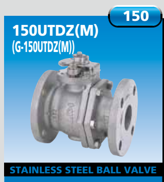
Full bore, Floating ball, Flanged ends Body Material: CF8/CF8M(UTDZM) Size: 2~10