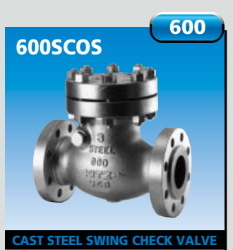
CAST STEEL SWING CHECK VALVE Bolted cover, Flanged ends Body Material: WCB Size: 2~24