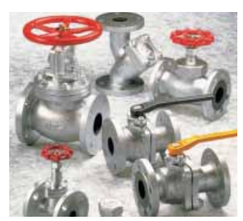
Ductile Iron Valves