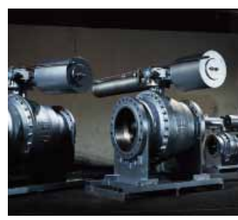
Steel Ball Valves, Trunnion Ball Design