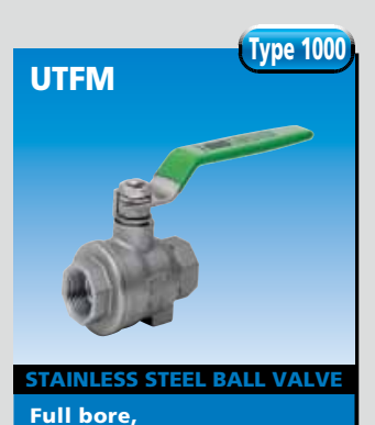
Full bore, Threaded ends Body Material: CF8M Size: 1/2~2