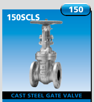
BB, Rising stem, OS&Y, Flanged ends Body Material: WCB Size: 11/2~36