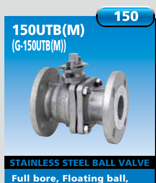
Full bore, Floating ball, Flanged ends Body Material: CF8/CF8M(UTBM) Size: 1/2~10