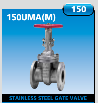
BB, Rising stem, OS&Y, Flanged ends Body Material: CF8/CF8M(UMAM) Size: 1/2~24