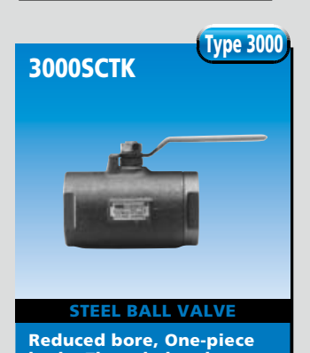
Reduced bore, One-piece body, Threaded ends Body Material: A105 Size: 1/4~2