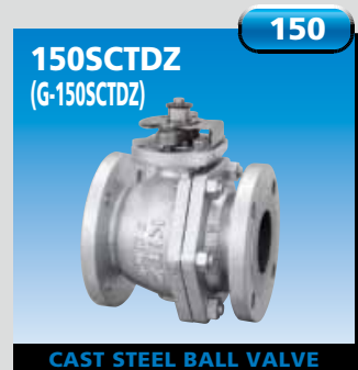
Full bore, Floating ball, Flanged ends Body Material: WCB Size: 1/2~10