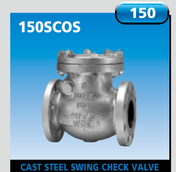
Bolted cover, Flanged ends Body Material: WCB Size: 11/2~30