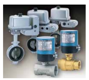
Electric Actuated Valves