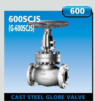
BB, Rising stem, OS&Y, Flanged ends Body Material: WCB Size: 2~12