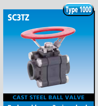
Reduced bore, 3-piece body, Threaded ends Body Material: WCB Size: 1/2~2(Lever handle available)