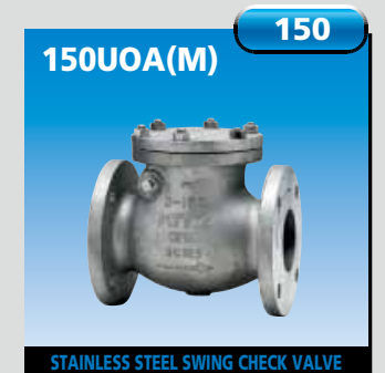
Bolted cover, Flanged ends Body Material: CF8/CF8M(UOAM) Size: 11/2~24