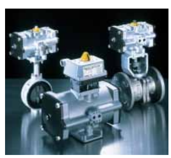
Pneumatic Actuated Valves