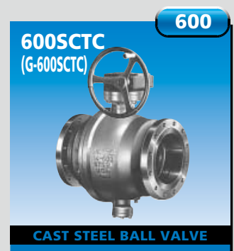
Full bore, Trunnion ball, Flanged ends Body Material: WCB Size: 2~30