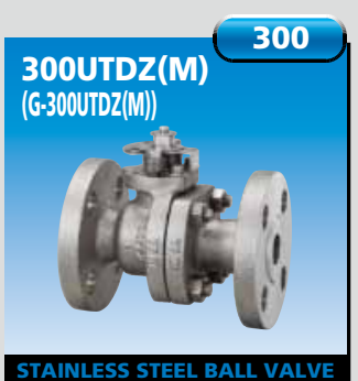
Full bore, Floating ball, Flanged ends Body Material: CF8/CF8M(UTDZM) Size: 1/2~8