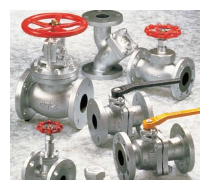
Ductile Iron Valves