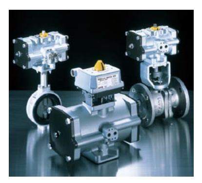
Pneumatic Actuated Valves