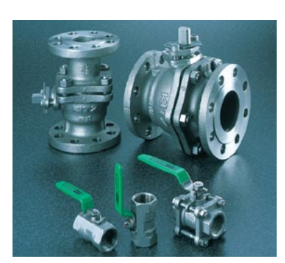
Steel Ball Valves