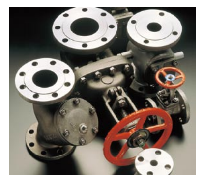
Stainless Steel Valves