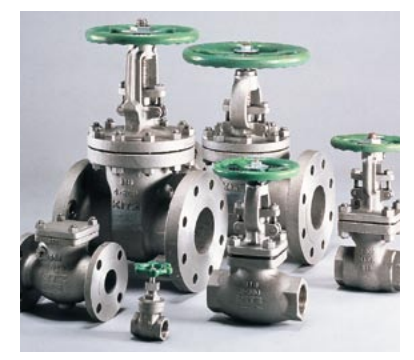
Stainless Steel Valves