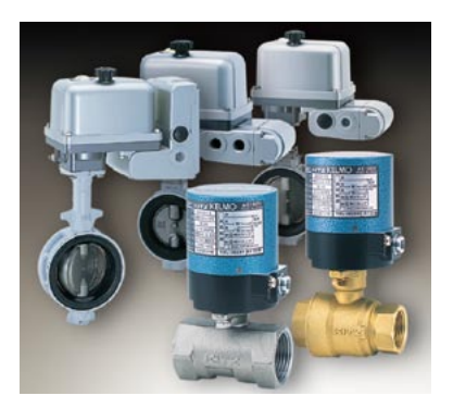
Electric Actuated Valves