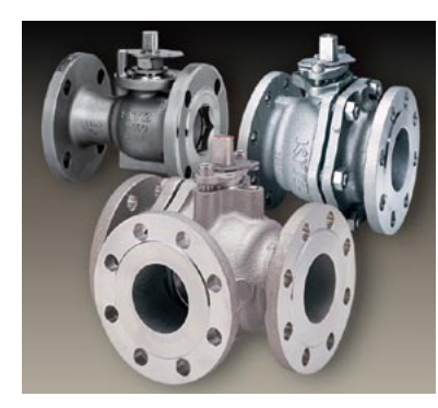
Stainless Steel Ball Valves